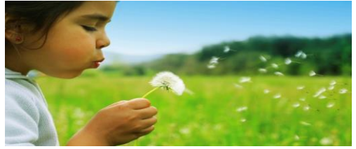
Children view the world with endless wonder

We invite you to register for virtual and indoor and outdoor sessions at www.KEYON.ca Hamilton EarlyON new registration system create your account at www.KEYON.ca